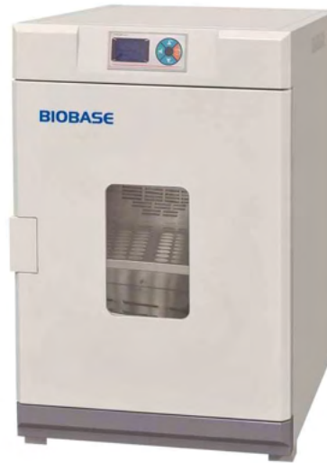
BOV-V70F/BOV-V136F/BOV-V225F/ BOV-V429F/BOV-V640F/BOV-V960F (Optional RS-485 interface for this series)