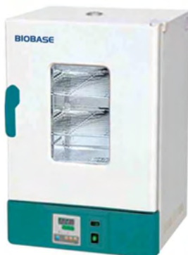
BOV-V30F/ BOV-V45F/ BOV-V65F/ BOV-V125F